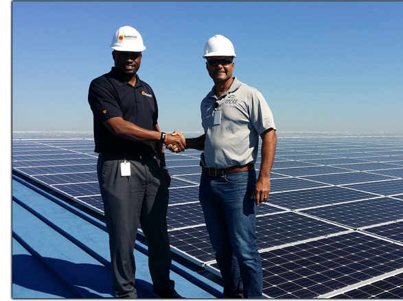
Contracting . . .

ÖZGÜN GRUP acts as a sub-contractor at large scale solar projects wherever in the world, where the Company will self perform the electrical, mechanical, civil and commissioning works while maintaining high H&S standards, meeting tight deadlines and preserving the quality of works.