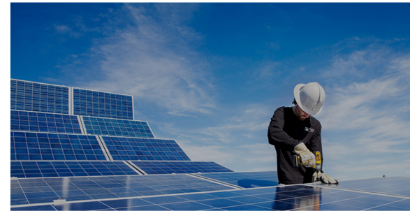
Commissioning and maintaining . . .